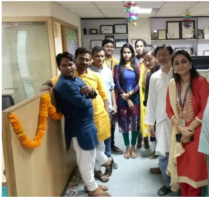
Team Head Office